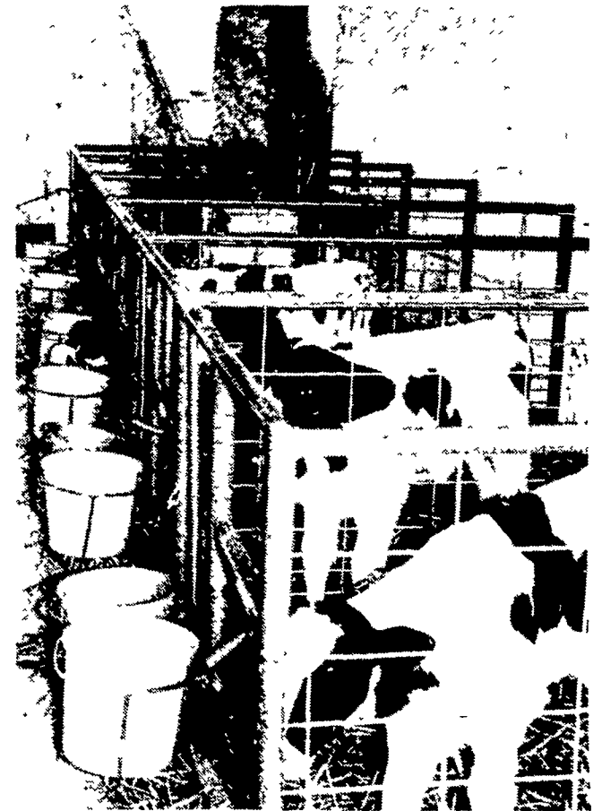
Individual calf pens were specifically fabricated for the nursery in the original barn of Ungemach farm, near Campbelltown.