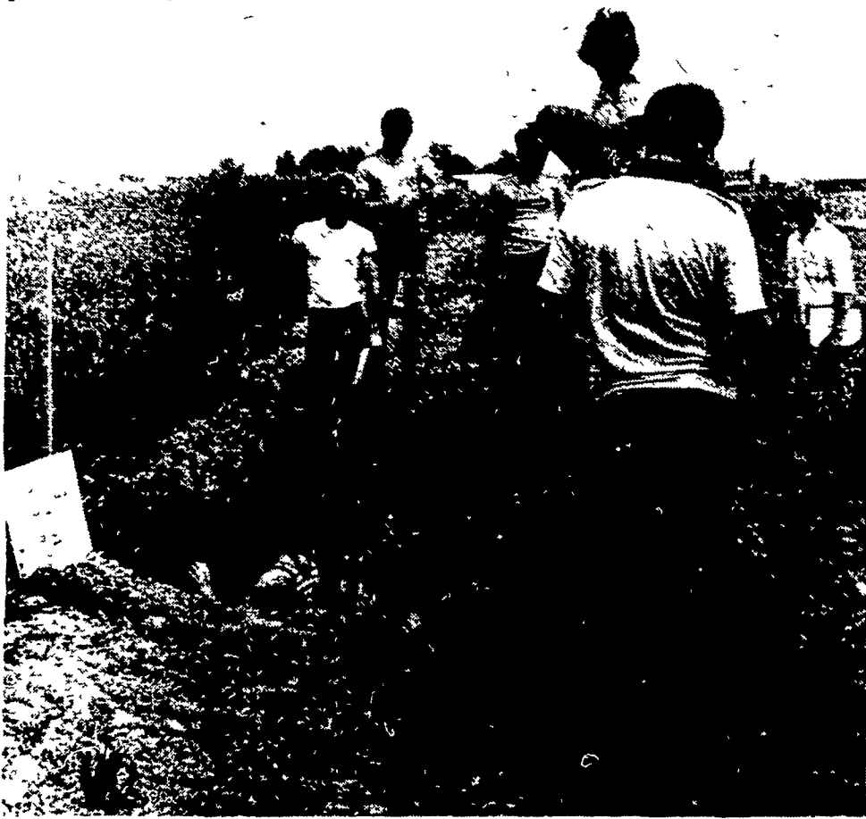
Students survey the trench on the Roy Eager farm that was used in Tuesday's land judging.