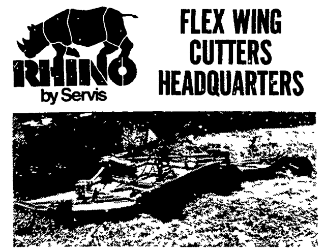
Mows big acreage . . . of grass . . . crop residue fast. Rhino Ruggedness keeps operating cost low! Cutters in stock: 6', 8', 10', 15' & 20'

SEE US FOR ANSWERS ABOUT INCORPORATION OF HERBICIDES