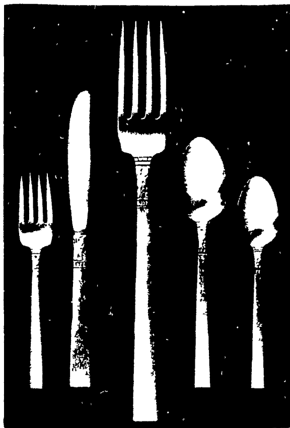
DANISH MODERN BROOKWOOD