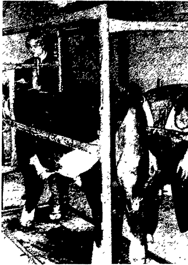
Putting on the finishing touches.