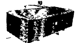
The Lowest Pouring Height On The Market Today - 34"!!

SPECIAL PRICE THRU APRIL ON ALL SIZES GIRTON D5 AMBASSADOR TANKS