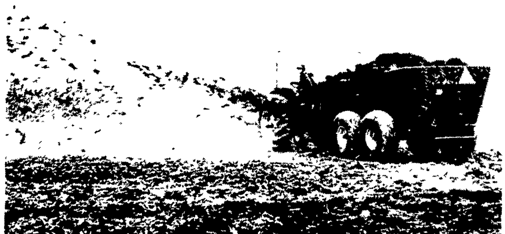
An even pattern up to 50 feet wide. At a rate of up to 3 tons per minute.