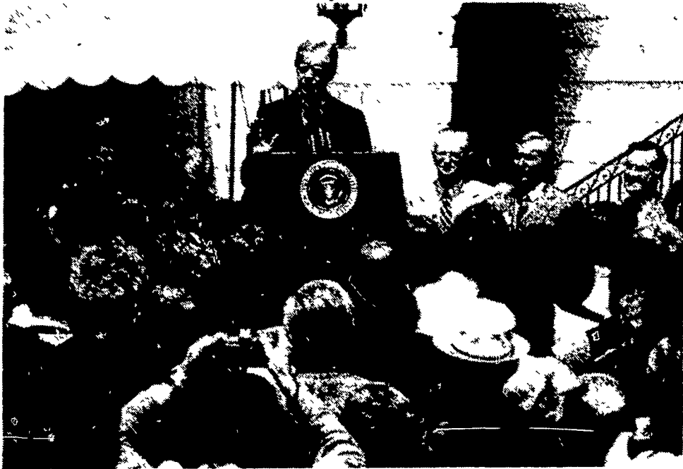
President Jimmy Carter addressed 925 delegates and alumni friends of the 50th annual 4-H conference on the White House Lawn. The group visited the White House as part of its program for the annual conference. The President told the group that 4-H'ers help build unity in America's youth. Maryland 4-H'ers from Carroll, Cecil, Charles, Montgomery and Somerset counties were part of the delegation.