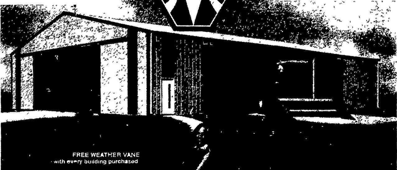
FREE WEATHER VANE with every building purchased

(including sliding doors). So, if you're in the market for a new building...look to the proud name of Morton Buildings for beauty, quality and security. Call the nearest Morton Sales Office (listed below) today for a tour of buildings in your area.