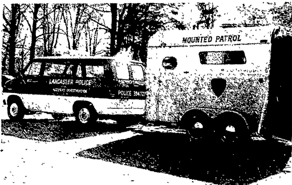
This rig can be seen traveling the Harrisburg Pike whenever schedules are too tight to allow the 45 minute ride into Lancaster or at night when the ride becomes dangerous.