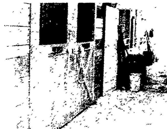
The stalls in the petting zoo barn were built by the combined efforts of a city carpenter and students from the local vo-tech.