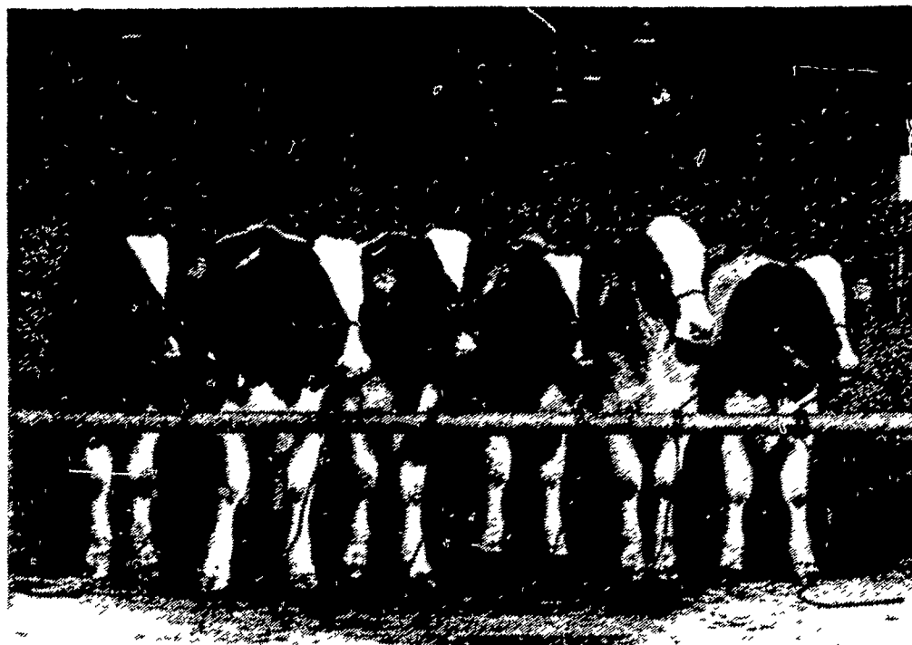
These six bull calves, out of Mowry-C Princess Corrine, all have been incorporated into the Curtiss AI stud.

Following super ovulation, Corrine was bred with semen from two sires simultaneously. These sires had been carefully selected for blood type, so exact parentage could be deter-