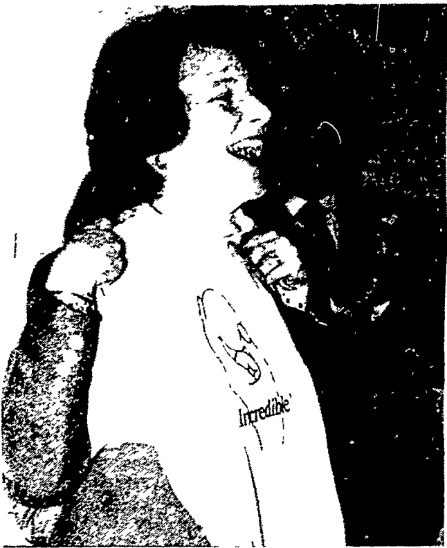
The Governor's wife models her new tee shirt.

Call 717-834-5919 For Additional Information