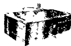
The Lowest Pouring Height On The Market Today - 34"

Special Prices Through March New - Girton D-4 500 & 600 Gal. Tanks