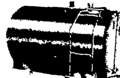
Made For Pipelines And Automatic Washing