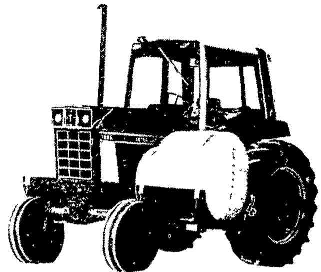
400 Gal. Side Mount

COMBINE QUALITY SPRAYERS WITH HOOBER'S CUSTOM-BUILT CHEMICAL INCORPORATION SYSTEMS AND GET RESULTS!