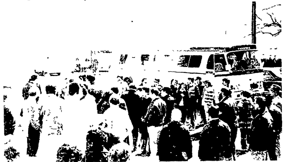
Holstein tour group from Lancaster County prepares to enter barn on MarCove Farms, located near Martinsburg.