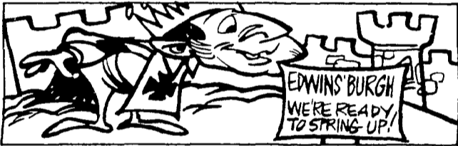
Edinburg, Scotland, is named for the 7th century King Edwin, around whom the settlement of Edwin's Burgh sprang up.

If both the Senate and the House pass a bill, and the Governor signs it, it becomes a law.