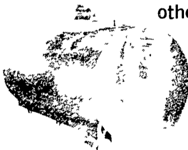
Pump shroud shown removed for detail

The Tank with Features no other tank can offer