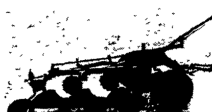
#2741 - IH - 3F - 14" Trailing Plow Price - $225 00