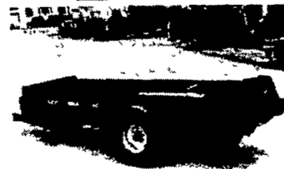
#4695 - New Idea - 214 New Web Price - $1,750.00

master charge PARTS DEPARTMENT — Call Us, We Probably Have It! VISA