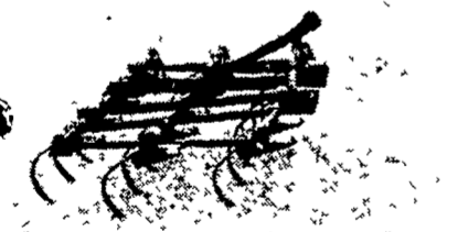
#3283 - IH - #45 vibra Shank 9 1/2' mounted