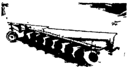
#3854 - IH - 700 7F - 16", In Furrow Price - $2,100 00