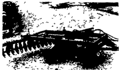
#4784 - Miller - 12'