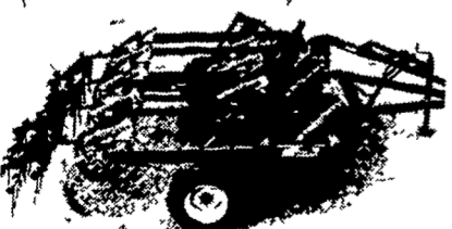
#4661 - Glencoe Soil Saver 9 shank