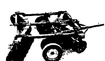
#4170 - Deere - 13' Model 1520 24 Disks