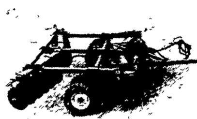
#4949 - Deere Model 1630 24 Disks