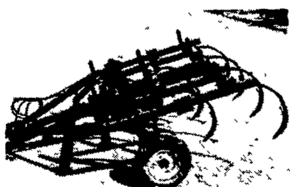
#4965 - Brillion - Trailing 12 shanks