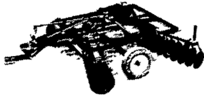
#2349 - IH - 370 11'6" 36 Blades