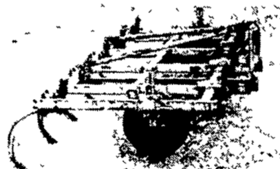
#3495 - Taylorway 3 Point - 11 Tooth. Price - $1,350 00