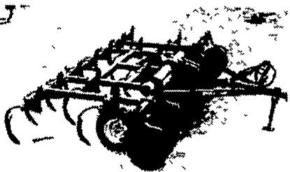
#3429 - Krause 13 Shank Chisel w/ Stalk Slicer Attachment. Price - $3,800.00