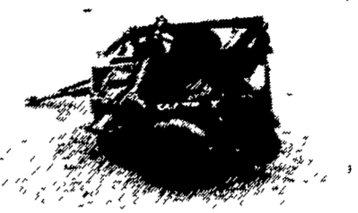
#3689 - Oliver 10' Price - $995 00