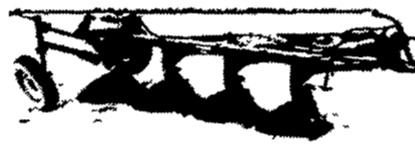
#2441 - IH - 540 - 4F 16" Price - $1,200 00