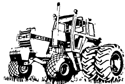
Save on new Case 90 series 2 WD s