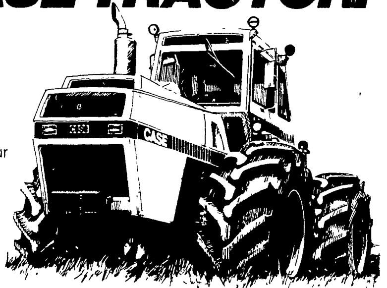
Save on new Case 90 series 4-WD s

We've got the incentive dollars from Case and a free hand to pass them along if you buy one of our new Case farm tractors during March, 1980