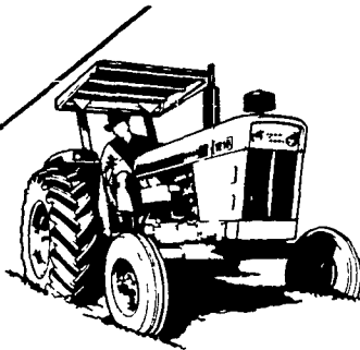
Save on new Case low profile models