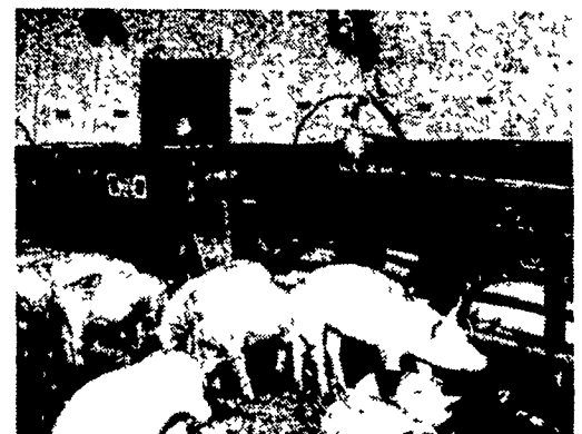
CIRCULAR CONED FLOOR is divided in half by Radial Arm Cleaning unit and gate on which feeders are mounted. On command motor drives gate around pivot moving manure to gutter. Material flows down gutter pushed by scraper paddle into pipe and out of building.