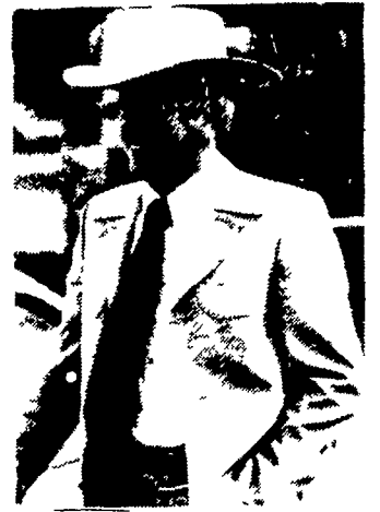
THE DETROIT CONNECTION