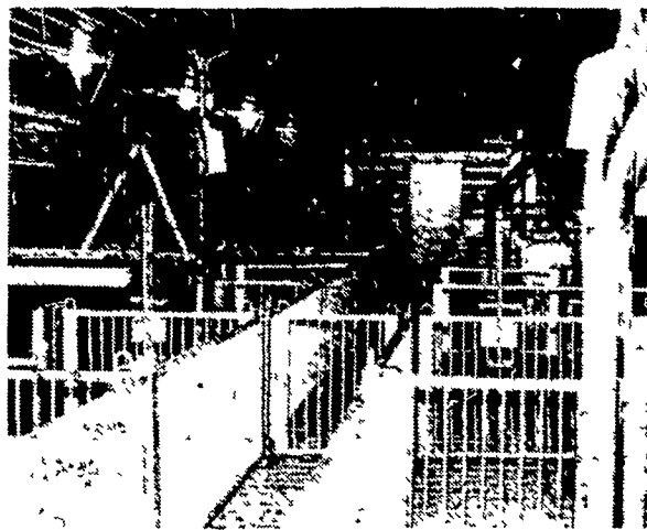
CONFINEMENT FENCING Confinement Vertical Fencing