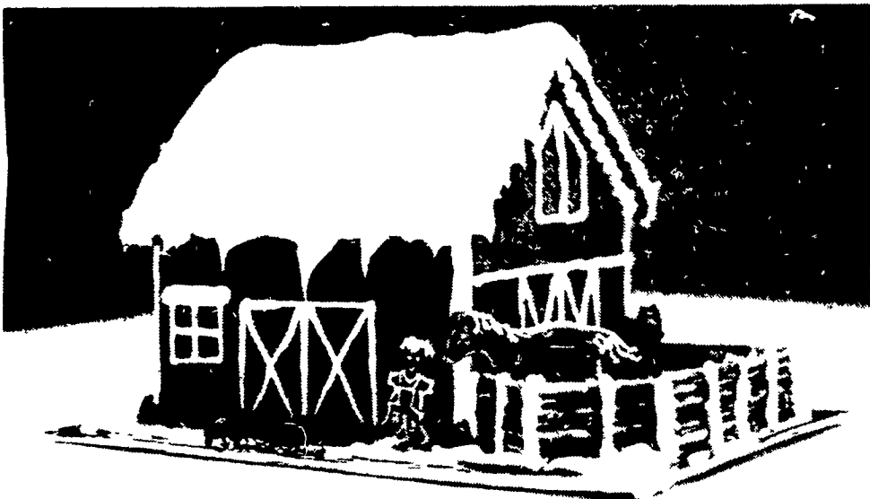
Every individual barn was complete with details such as crosspiece doors, windows, pretzel stick barnyard fence, farmer and his livestock.