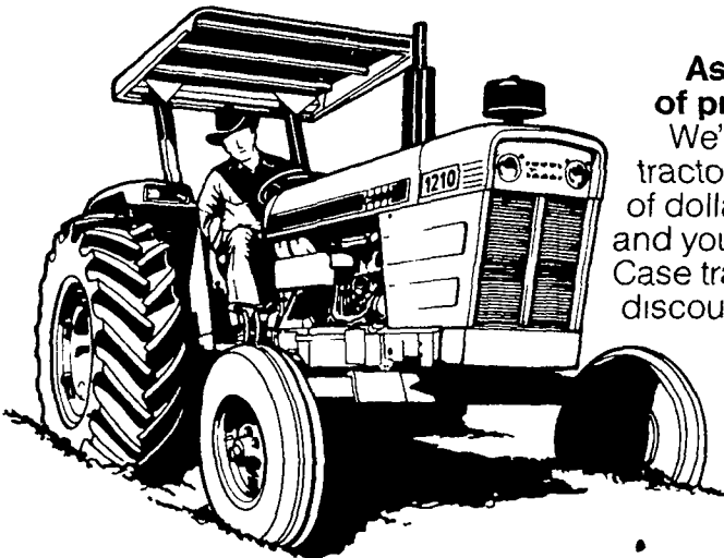
Save on low profile models

As your Case dealer we have the kind of prices you'll like best...low, low, low! We're cutting the price of every Case farm tractor by hundreds (or thousands, maybe?) of dollars. How much depends on the model and your bargaining skill. These are the latest Case tractors—offered at some of the biggest discounts ever. But you must make your purchase during March, 1980. See us now and get the deal of a lifetime on a great new Case