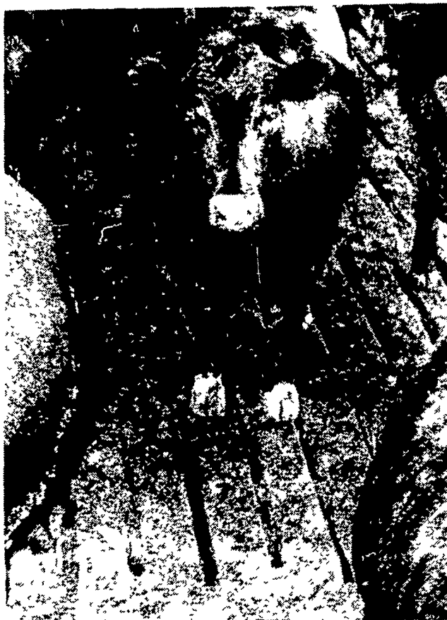
The steers on the Forry Farm are fed-out on slatted floors, with the manure pit underneath.