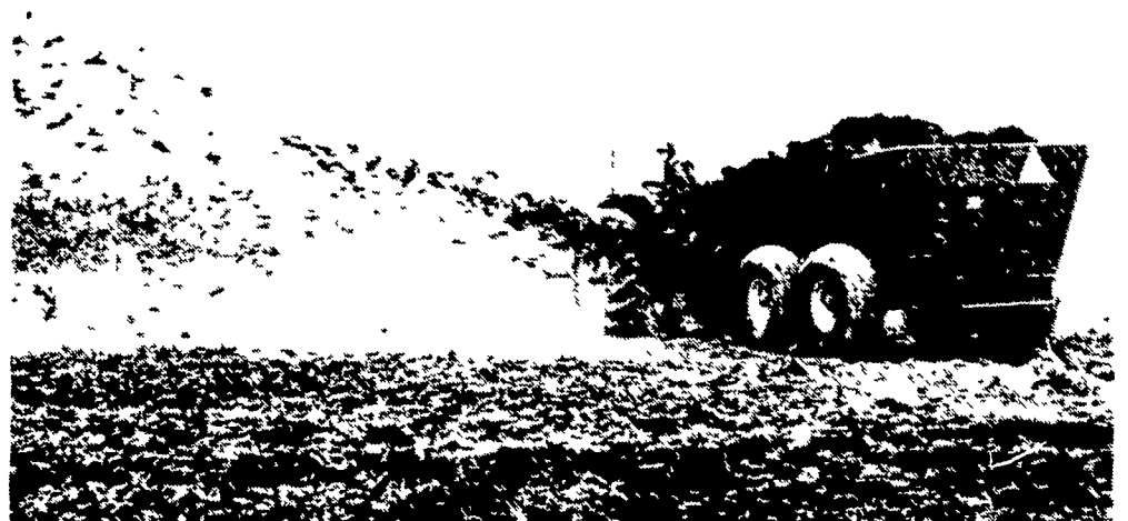
An even pattern up to 50 feet wide. At a rate of up to 3 tons per minute.

12:30 — ROBERT L. KAUFFMAN FARM. Peach Bottom Picket fence earthen bank unit stores manure from tie stall barn, free stall barn and feed lot. Liquids drain into a second earthen bank unit. From Rt 272 about 5 miles south of Buck, turn west onto Prowls Hollow Road and go to the first farm.