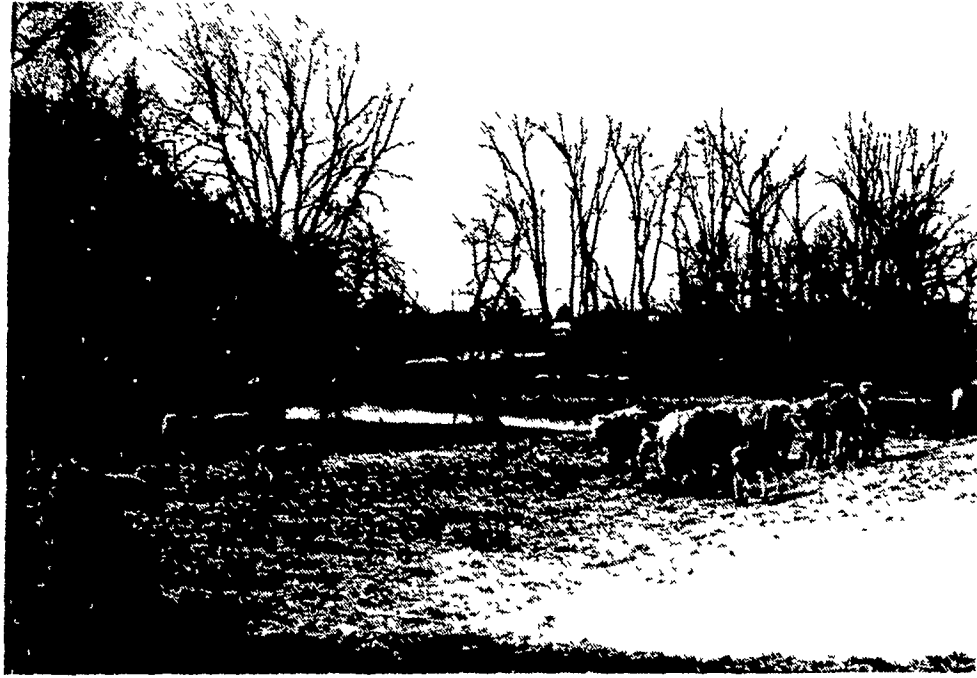
The out-of-state visitors were welcomed by some of Beechdale Farms' newborn calves.