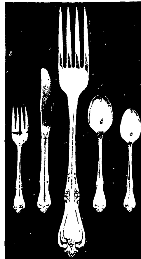
TRADITIONAL BRIARWOOD PATTERN

5-piece place setting of beautiful Danish-modern stainless flatware or of handcrafted stainless