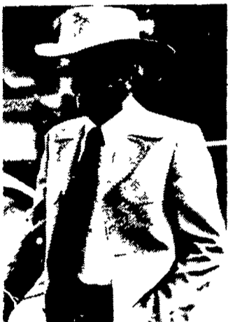
THE DETROIT CONNECTION

* FROM YOUR HOME TO JACK LOWRY DODGE. UP TO $20.00