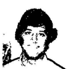
Installation AMOS FISHER