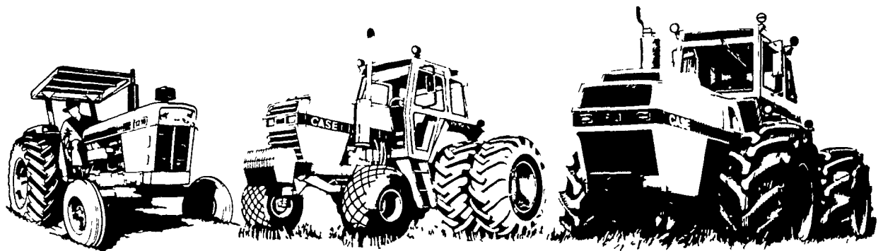
Low profile models — 5 models 43 to 80 pto hp