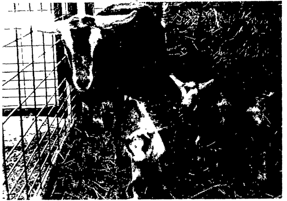
The stars of the Blue Mountain Dairy Goat Club's Expo display were these kids born before a crowd of about fifty spectators.

So while goats and their owners may have one foot in the door toward their objective, it appears they need to walk right in and have a chat with Farm Show officials if they hope to be included in any future functions.