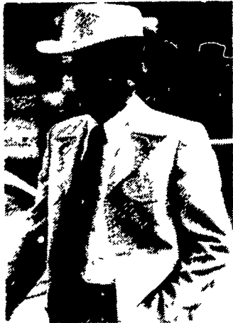
THE DETROIT CONNECTION