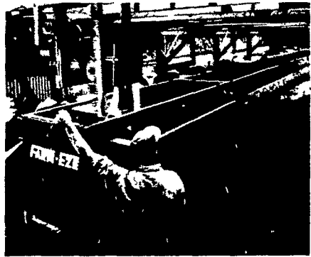
Farm-Eze will accept and distribute 250 pounds or more feed per minute to single- or double-sided bunks up to 200 feet long

FARM-EZE® BELT CONVEYOR lets you feed the right ration to any group in your herd... from one bunker