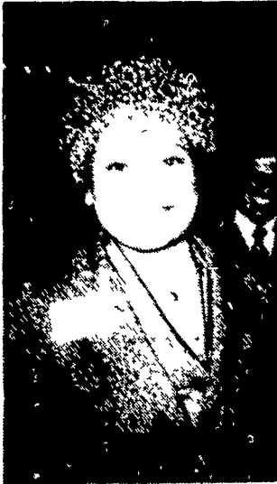
C. Delores Tucker, former state Commonwealth Secretary, the only woman running for the U.S. Senate seat, was present at the meeting.