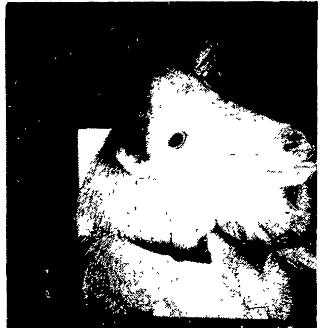
The senior herd sire flirted with the camera amid grunts and clicks.