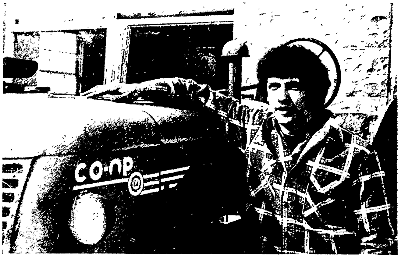
After a quarter-century of Lancaster County farm work, this vintage tractor will be driven by

Although it will be his initiation into the full-size (Turn to Page C16)