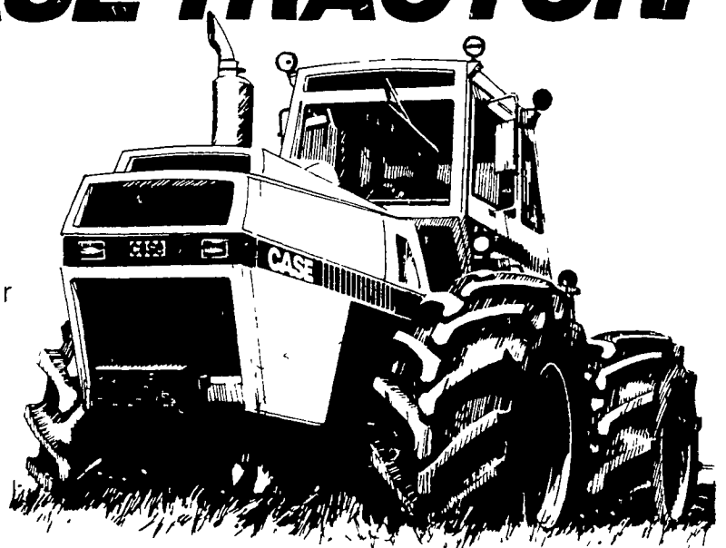
Save on a new Case 90 series 4-WD's

We've got the incentive dollars from Case and a free hand to pass them along if you buy one of our new Case tractors during February, 1980