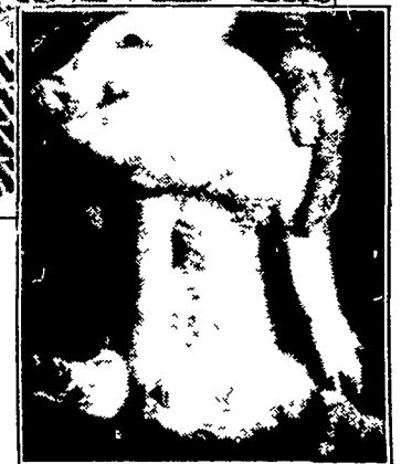
Sore-free legs and feet

Now—an idea, new to America, whose time has come . . . that has so many advantages that all other types of flooring (metal, concrete, plastic, etc.) are obsolete. It has a sound record of successful use in Europe for over ten years. It should be used for both new and existing livestock buildings. It's easy to replace all old, outmoded types of flooring.