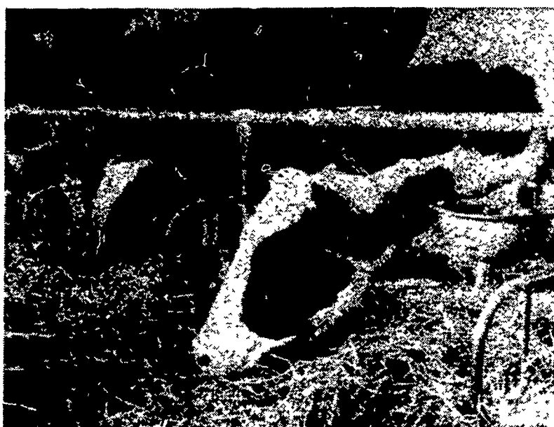
Longacre cows eat lots of hay. From left to right: