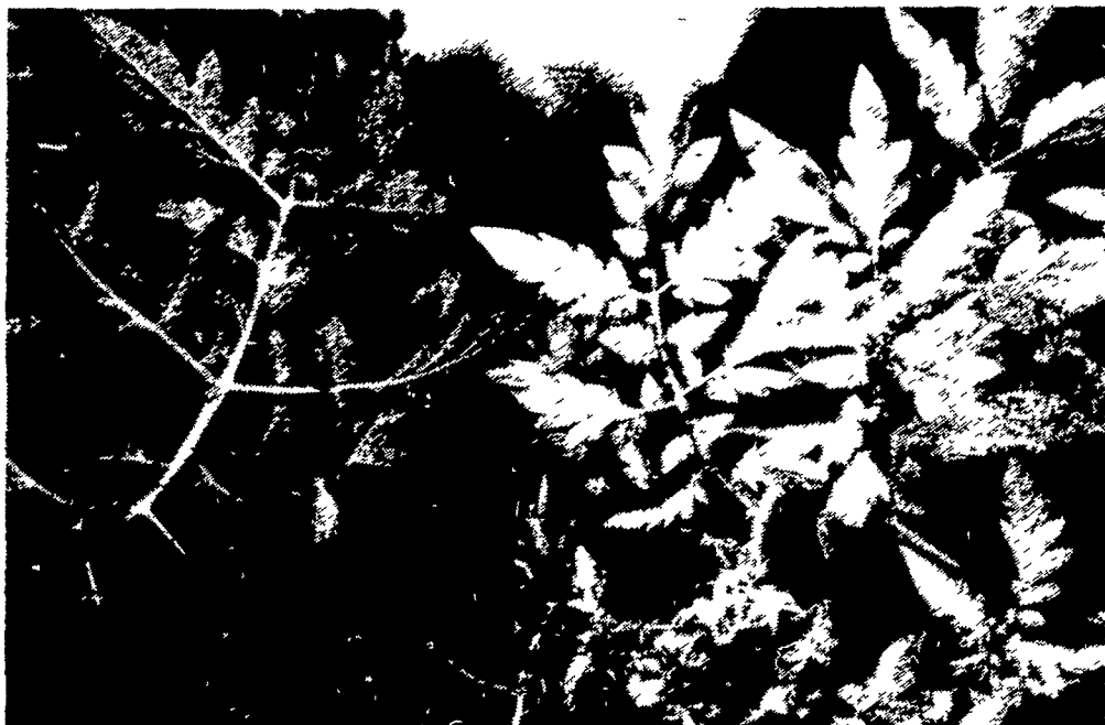
Tomato plants affected by a sulphur deficiency tend to be smaller and lighter in color than normal plants. Yellowing may occur in various parts of the plant. Leaf shape is not affected, but leaves tend to be smaller and closer together. Petioles and stems will show a marked reddening if the deficiency is severe.

Authorized distributor for Cyclone International, Inc.