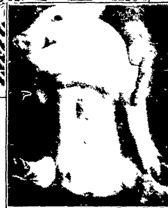
Sore-free legs and feet

Now—an idea, new to America, whose time has come that has so many advantages that all other types of flooring (metal, concrete, plastic, etc) are obsolete. It has a sound record of successful use in Europe for over ten years. It should be used for both new and existing livestock buildings. It's easy to replace all old, outmoded types of flooring.