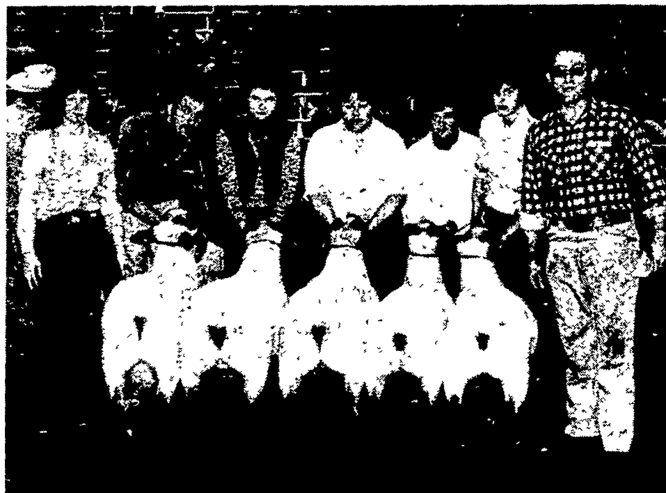
The Herr family exhibited the number one flock of Hampshire sheep.