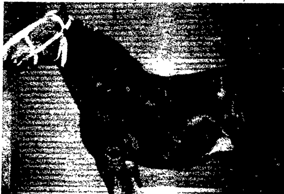
Highland Lassie, an eleven year old Belgian mare, set a Farm Show Record by taking the grand champion honors for six years.