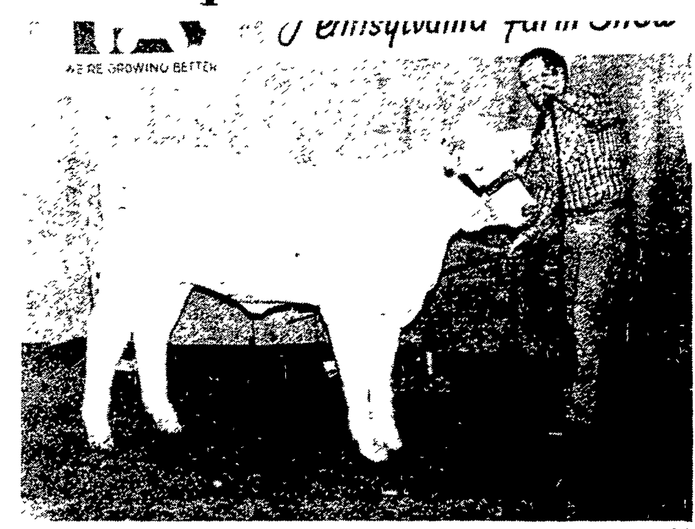
The grand champion female of the Farm Show's Charolais competition is RCC Royal Temptress 2927, owned by Royal Charolais Co., Westmoreland County.

In the female classes, Royal captured the grand championship and the junior championship with their spring heifer, RCC Royal Temptress 2927. Their RDD Royal Lady, a summer yearling backed up the