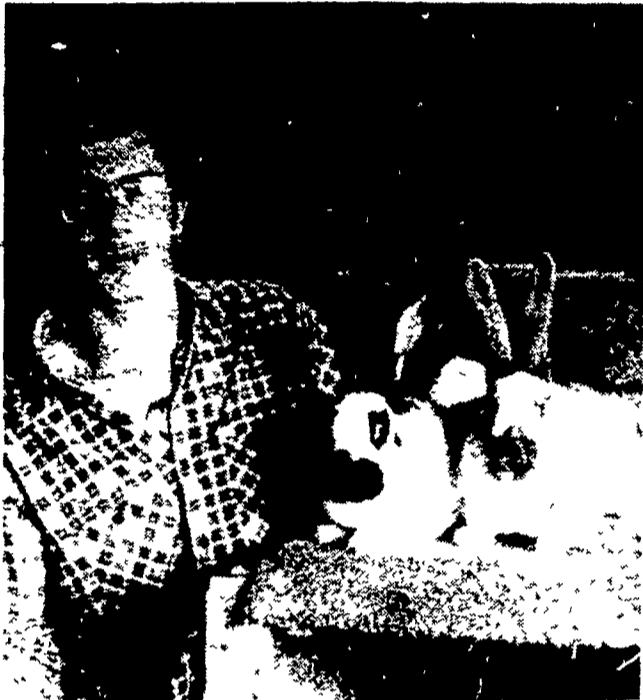
One of Trostle's newer livestock activities is the breeding of pedigreed American Checkered rabbits.