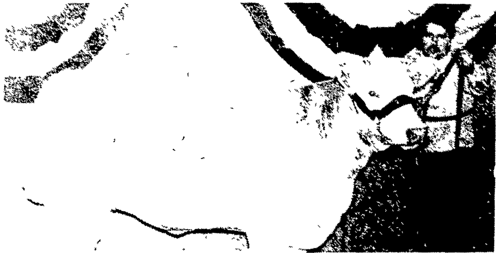
J.C. Enterprises, Ringgold, had the grand champion Charolais female at the 1979 Pa. Farm Show. Taking the top honors was J C Ladymont 732, a summer yearling heifer.