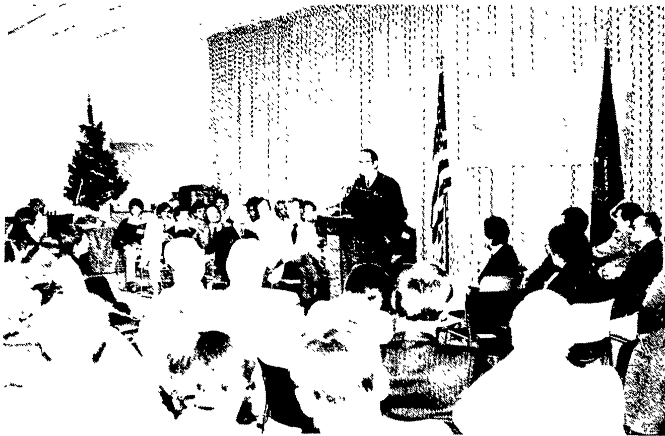
Governor Thornburgh held his first town meeting at Lancaster's Farm and Home Center on Tuesday night. The Governor answered questions from 21 constituents. The milk security fund,

farmland preservation, and the on farm production of ethanol were among the agriculture related issues discussed.