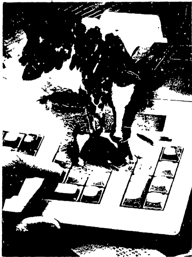
Figure it for yourself.