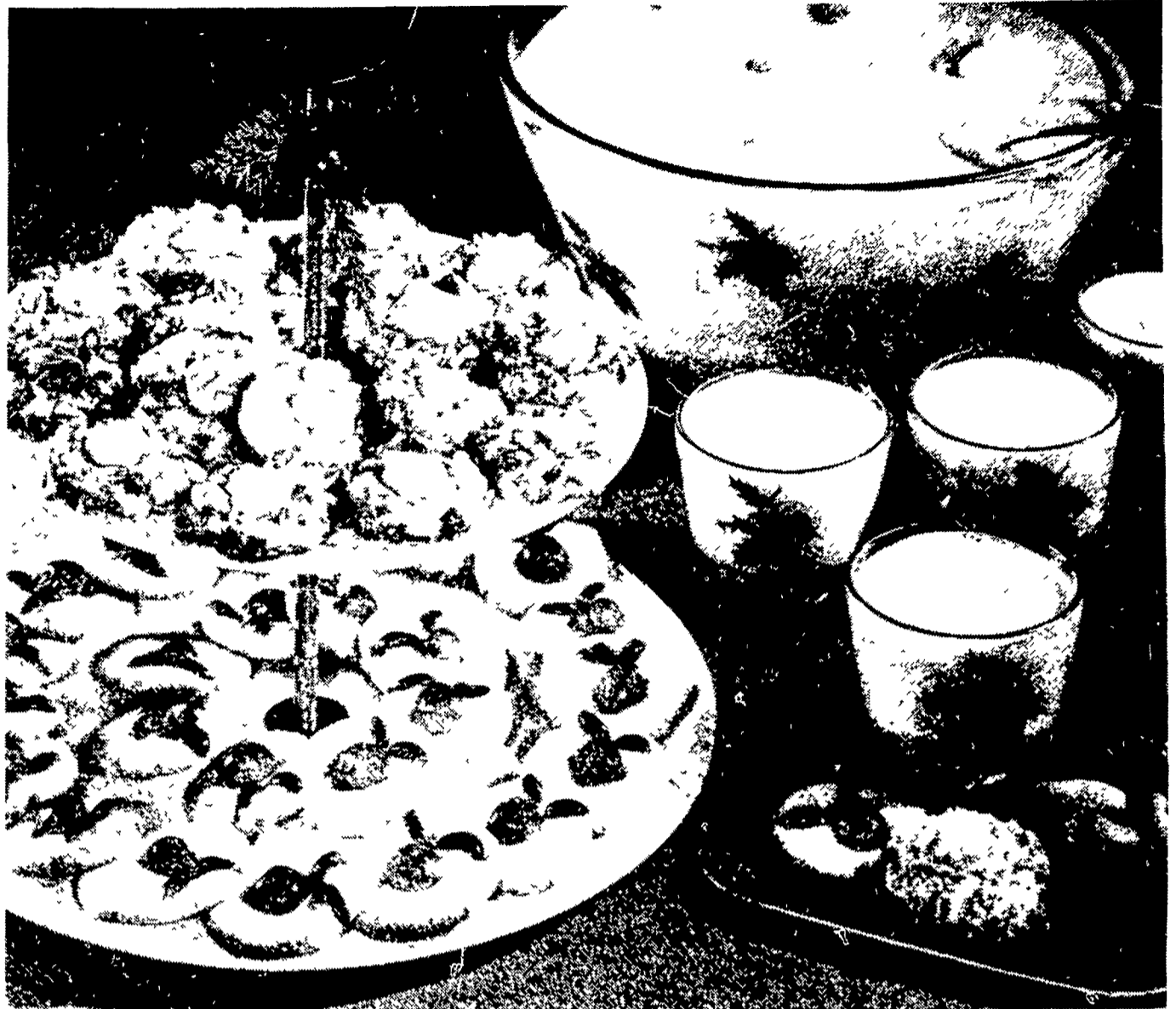
Here's a festive duet for holiday parties, butter cookies and eggnog topped with whipped cream. Both Party Butter Cookies and Anise Butter