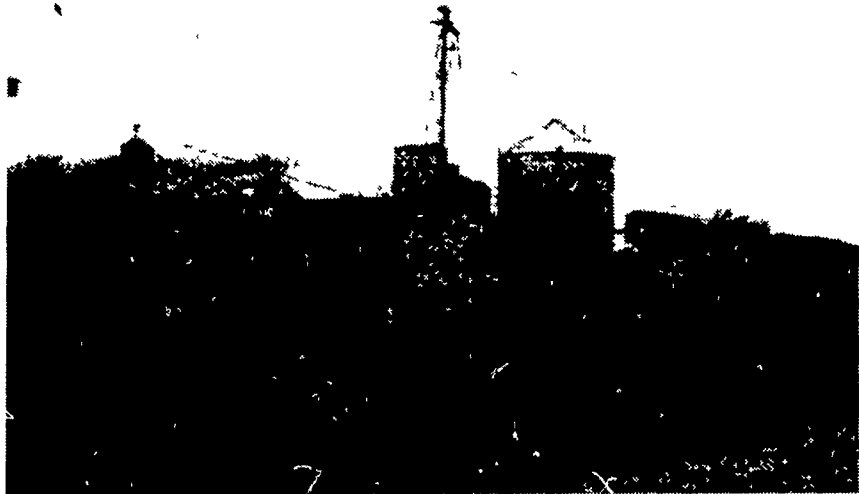
Hillside Poultry Farm, Chambersburg, Pa.