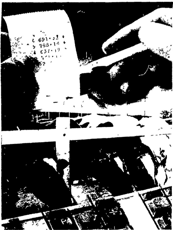
Figure it for yourself.

YES, it costs 40% less than conventional steel buildings! PARTY CONSTRUCTION CO., INC. 1218 Steuben St. Utica, N.Y. 13501 315-724-5593